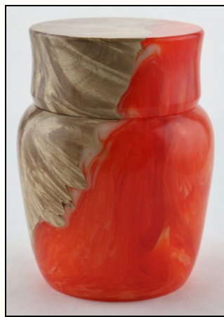
Lidded Hollow Form by Heath Knuckles

Purchase now from your favorite EWT Retailer or at Easy Wood Tools .